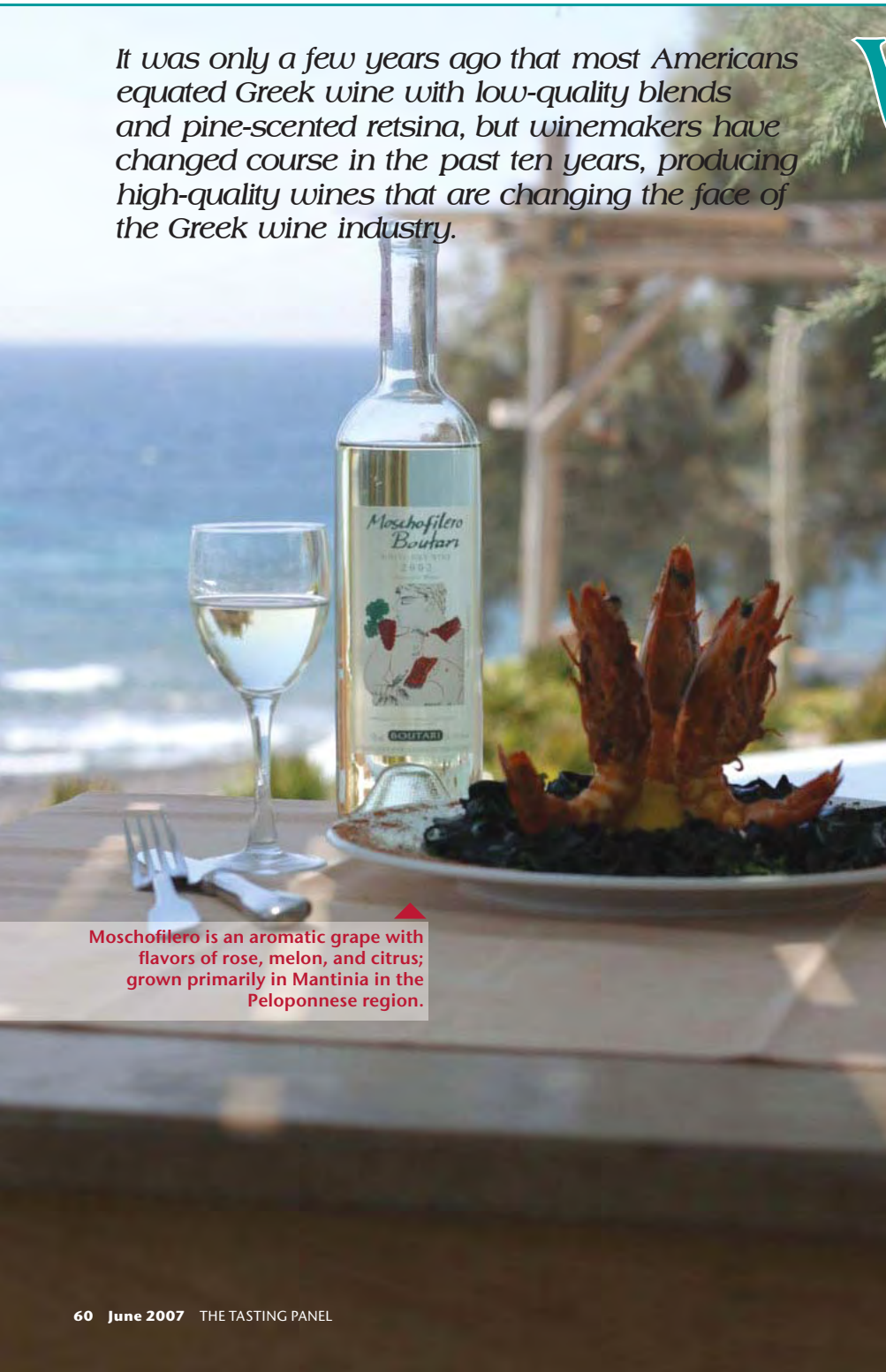
Moschofilero is an aromatic grape with flavors of rose, melon, and citrus; grown primarily in Mantinia in the Peloponnese region.

It was only a few years ago that most Americans equated Greek wine with low-quality blends and pine-scented retsina, but winemakers have changed course in the past ten years, producing high-quality wines that are changing the face of the Greek wine industry.