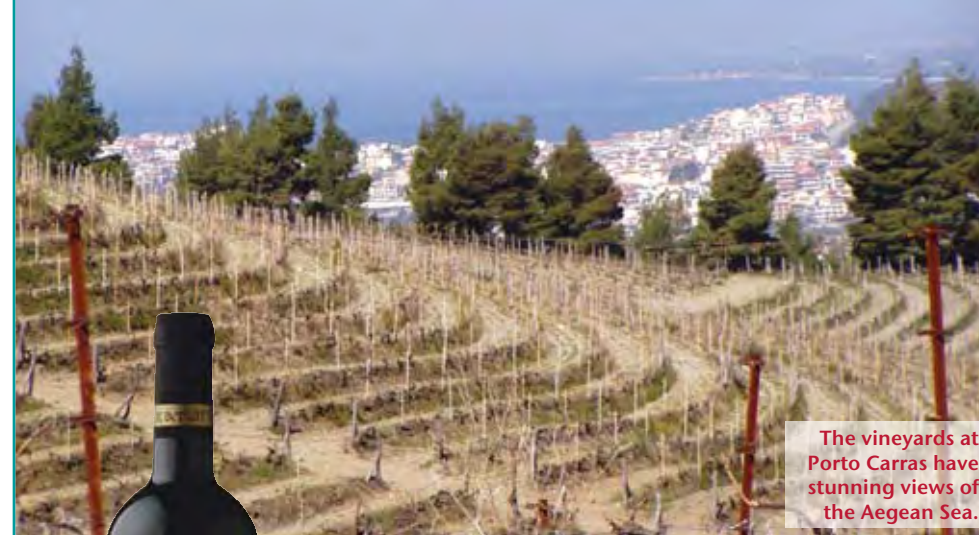
The vineyards at Porto Carras have stunning views of the Aegean Sea.